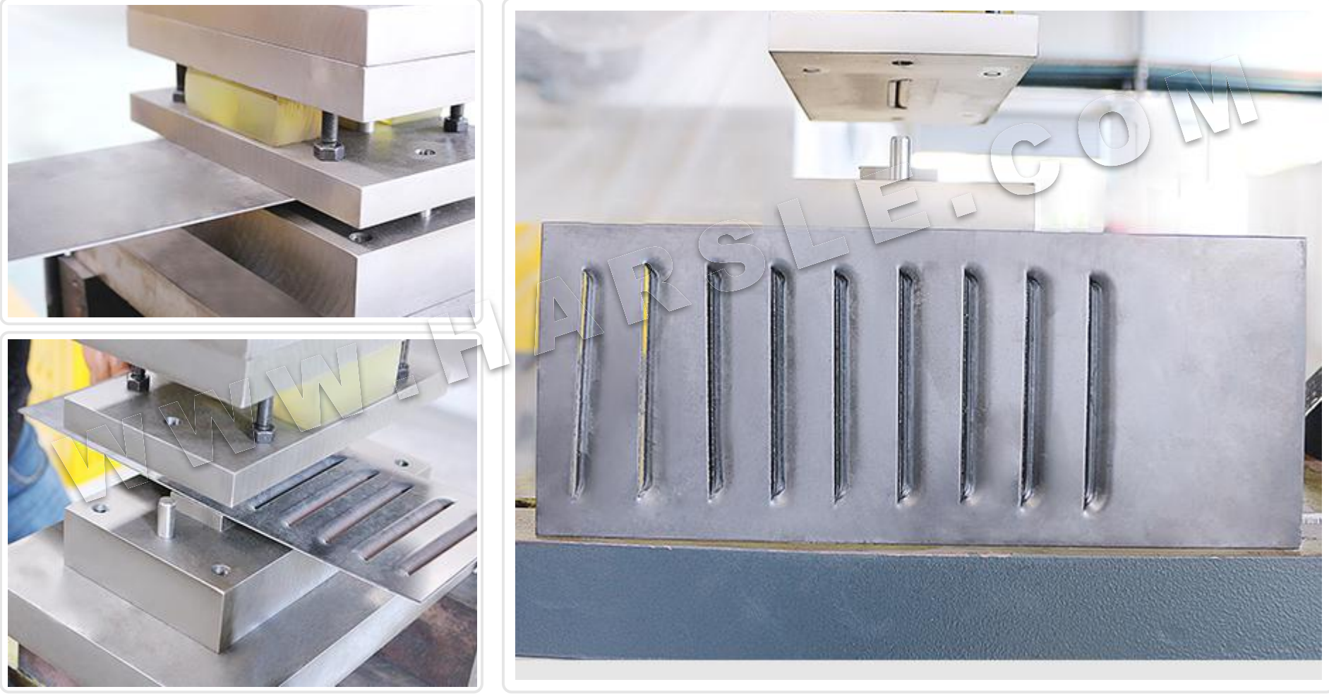
Louver Punching function shares the same position with hole punching function, it can form the Louvers step by step.