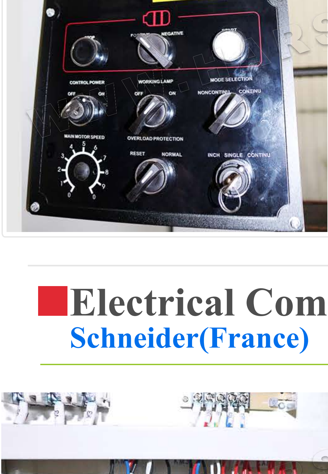
■ Electrical Components Schneider(France)