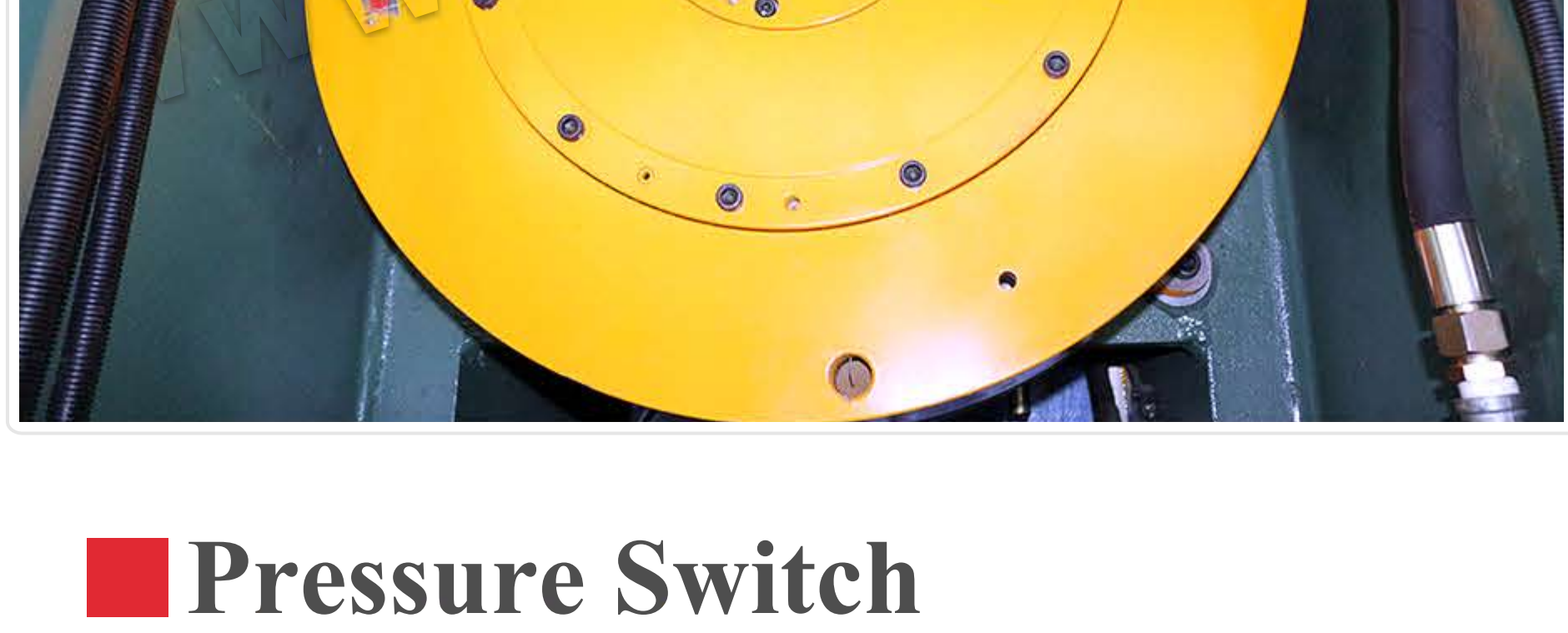
■ Pressure Switch ARK(South Korean)